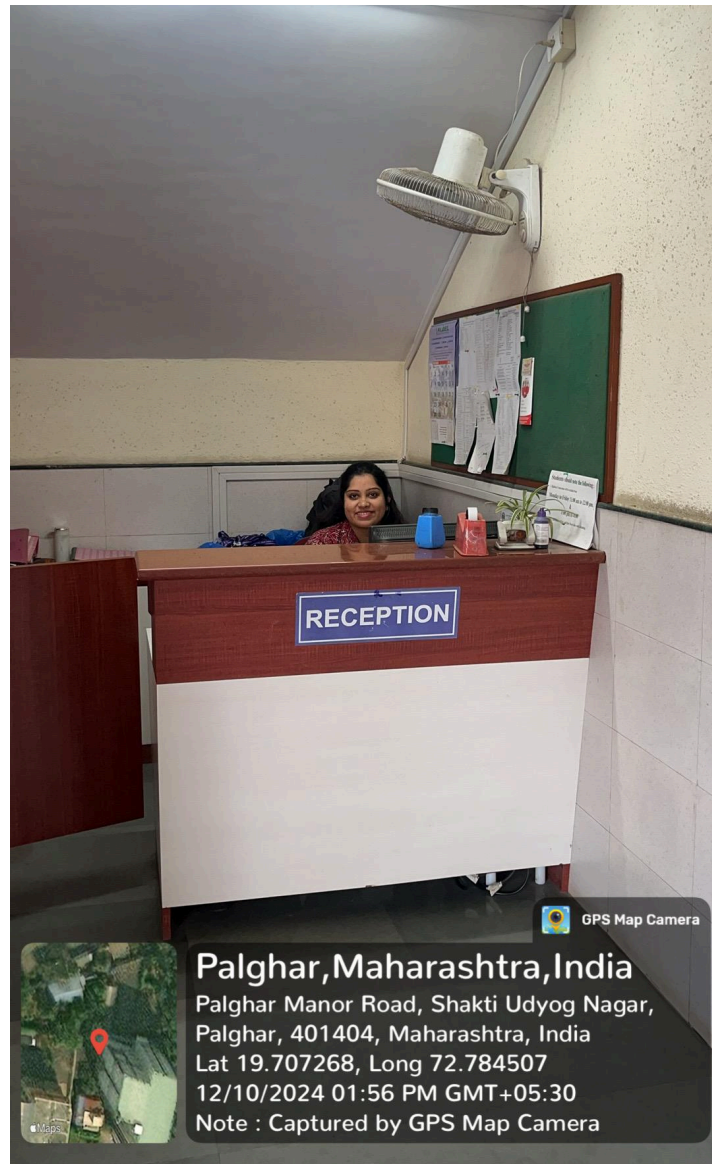
Human Assistant for Divyangjan Students

A Human Assistant is a trained individual who provides support and assistance to Divyangjan students in various aspects of their daily lives, including academic, social, and personal activities. The primary goal of a Human Assistant is to empower Divyangjan students to achieve their full potential and participate fully in school activities