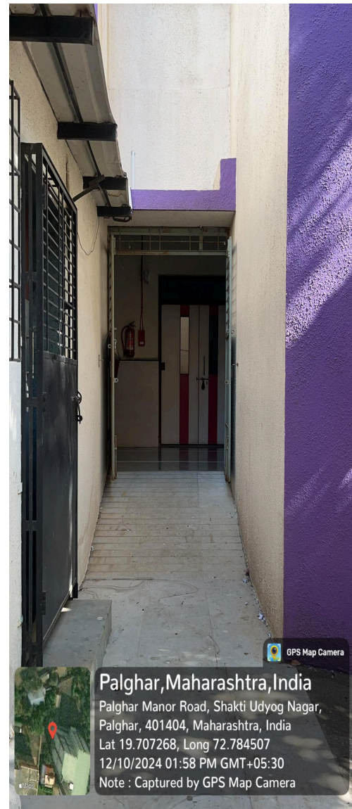
Geotagged Photo of Ramps