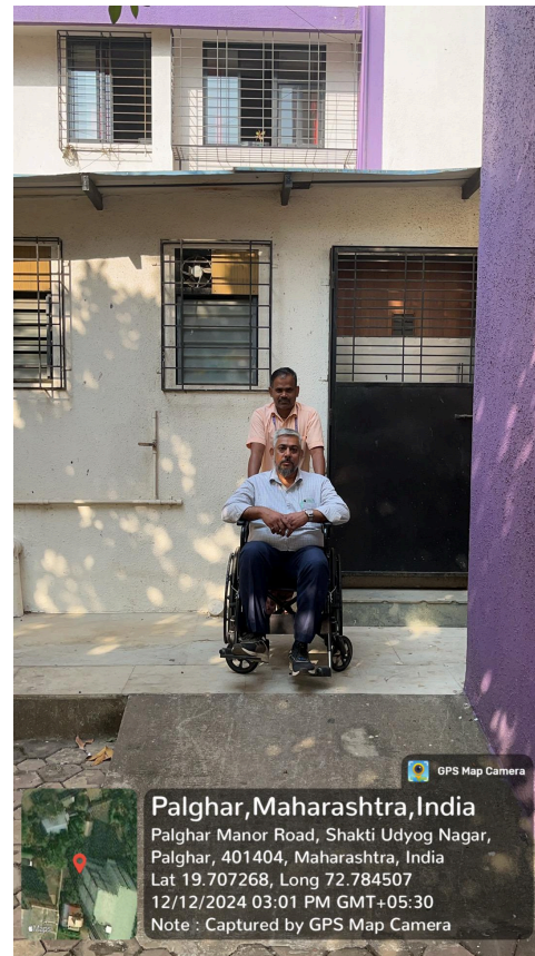
Geotagged Photo of Ramps