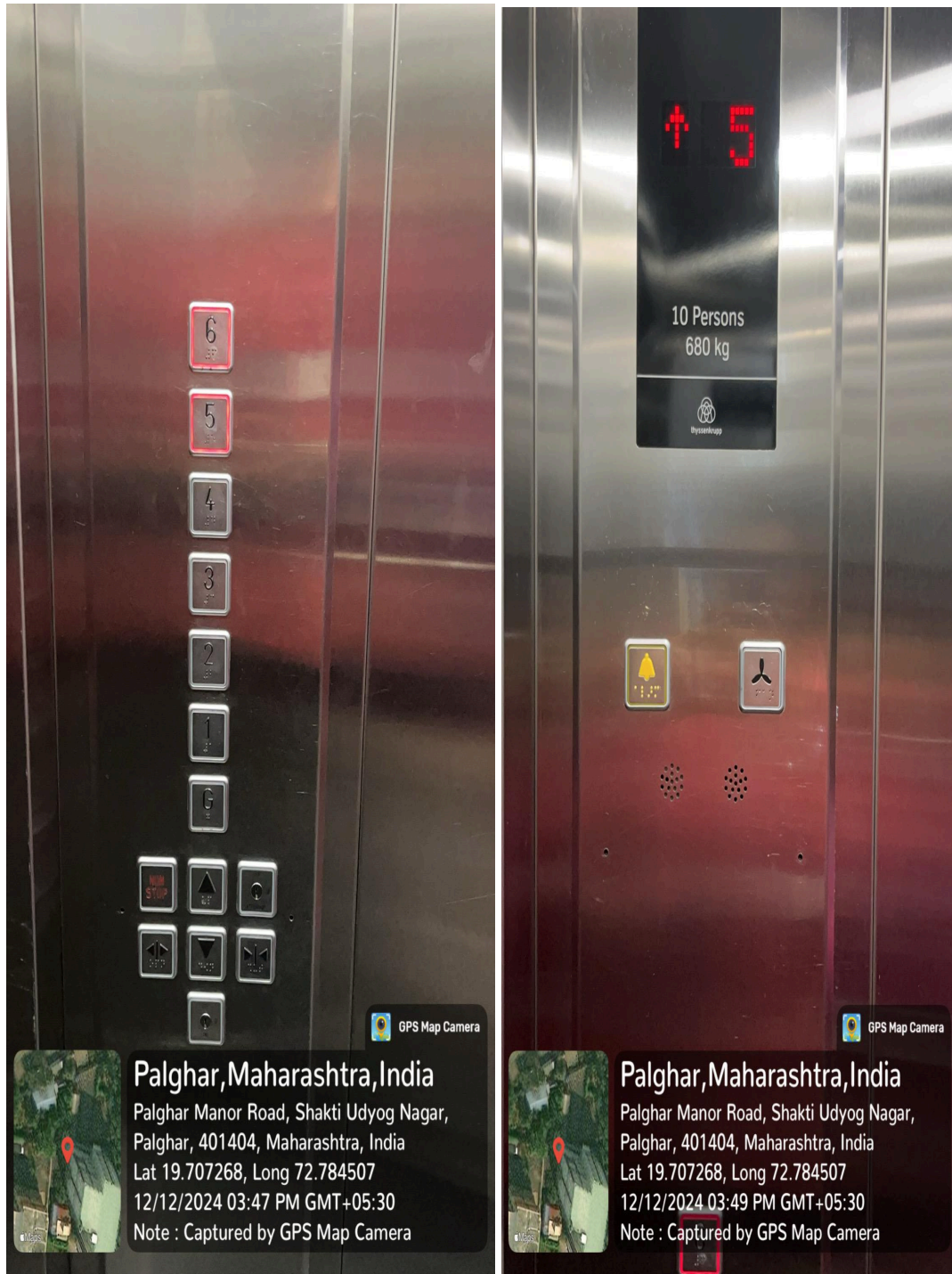
Geotagged Photo of Elevators for specially-abled and Divyangjan